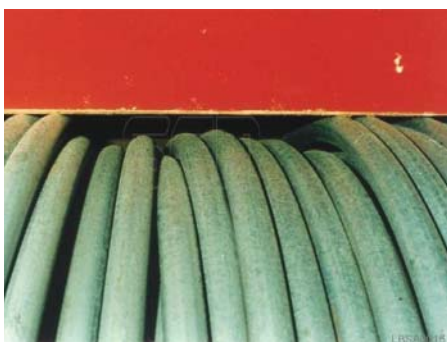
Example of an SGM Magnet handling a loosely wound coil.